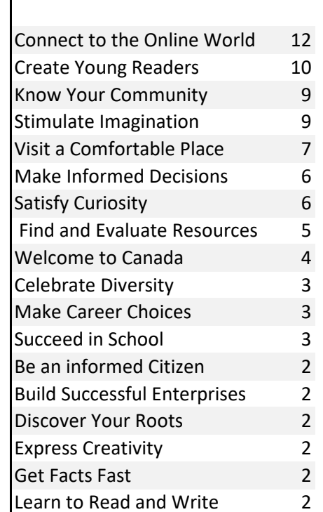
Question 1: Choose up to 5 areas you think the library should address in our service plan. Feel free to choose less if you identify fewer than 5.

After the needs assessment sessions each participant was emailed this survey. We recevied 17 survey responses. The data was finalized and collected November 21, 2020. Although each participant answered question one, some left question 2 blank or offered 2 responses. If someone chose 2 areas, 1 vote was added to each category.